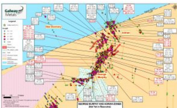
Figure 3: Longitudinal Section of the George Murphy Zone