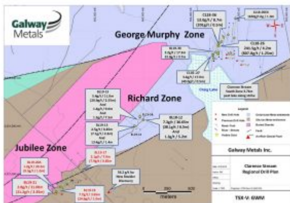
Figure 2: Plan Map of the Jubilee Zone