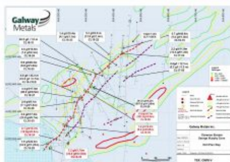
Figure 2: Grade x Thickness Long Section of the Main Structure in the George Murphy Zone